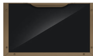
9005 JET BLACK